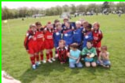
The U10s (as the U9s last season) at an organised soccer tournament