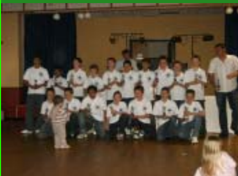
Managers, players, friends and family salute the lads at the annual Oadby Town Presentation Evening