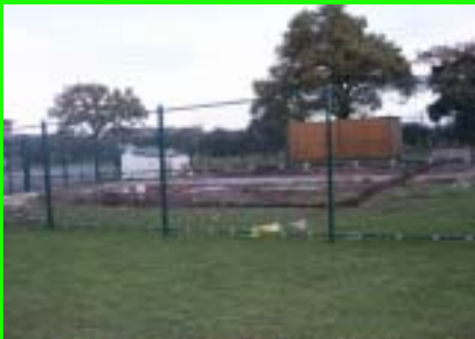
The foundations of our new clubhouse

We're getting a brand new purpose built facility of our very own! You'll have seen the fencing for the new building is now up – paid for in part by a grant of £5000 from Blaby DC. We will shortly be starting 'the build', the plans for which you may recall seeing at the Presentation Evening back in May. Just to remind you, the brand new facility will have 4 changing rooms, plus one for the referees. A kitchen, toilets, and a seating area which we hope will include a pool table and table football. In the time that has elapsed we have obtained planning permission, and have applied for a number of grants. Although the money is in place we are still hoping for a